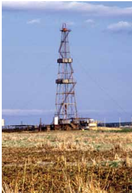
Anatoly Rakhimbayev/World Bank

become major sources of sub-national and national-level corruption. At times the funds have become a cause of frustration for stakeholder communities who have not seen tangible benefits coming from these funds. Even with the best intentions, local and national government agencies and extractive companies have often failed to design effective, sustainable development strategies around these funds. As a result, extractive companies and government institutions have approached USAID to help design and implement strategies to manage these funds.