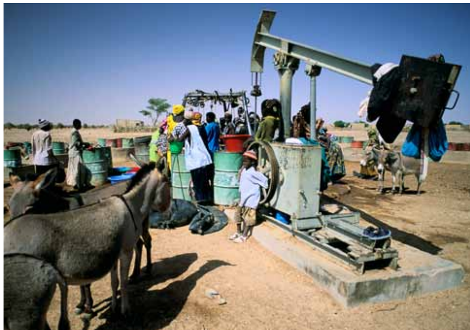
Curt Carnemark, World Bank

The role that minerals have played in fueling conflict has been well-documented over the last decade. 18 A 2004 study by USAID's Office of Conflict Management and Mitigation concluded that mineral extraction can lead to conflict in three primary ways: direct financing, social cleavages inflamed or created through extraction, and revenue-based corruption leading to social unrest. 19 For projects already in production, conflict with or between community stakeholders can mean disruptions and delays, substantial loss of revenue, or even revocation of a license to operate, as with Shell in the Ogoni areas of Nigeria. 20 Typically, conflict between communities and extractive companies have had their roots in issues such as land claims and access to resources, forced relocation, community compensation, decision-making and threatened livelihoods. 21