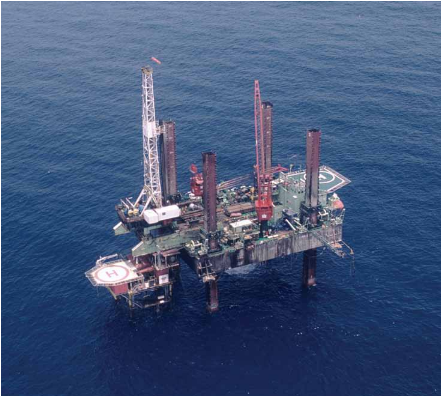
Curt Camermark, World Bank

shift in strategy. The expected increase in the numbers and roles of these companies – from junior mining companies scouring remote and sensitive locations for the next great discovery, to the foray of state companies from China and elsewhere into politically and environmentally controversial locales – challenges much of the progress made within the extractives sector in addressing sustainable development goals, addressing sources of corruption, mitigating environmental impacts, and addressing sources of social cleavage and conflict. USAID and other donors can play an important role in supporting industry progress in sustainable activities and promoting industry standards so that extraction activities deliver broad-based,