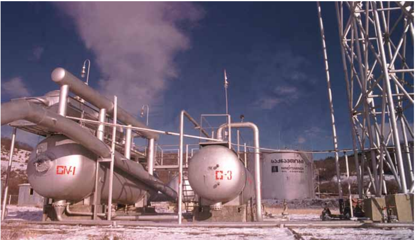
Yuri Mechtov, World Bank

sometimes look for assistance in designing sustainable development strategies to be supported by revenue from extractive projects. Particularly in Africa, USAID has a real opportunity, through partnerships, to help translate mineral wealth into raised standards of living and avoidance of the ‘resource curse.’