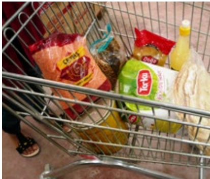
A refugee displays purchases made with their voucher.

In mid-2011 a violent crackdown on anti-government protestors exploded into a large scale conflict in Syria, forcing millions to flee. As Syria's largest neighbor, Turkey has opened its 511-mile border to over 500,000 Syrians seeking refuge from violence at home. Maintaining an open border policy with its southern neighbor, Turkey provides housing and relief services to hundreds of thousands of refugees living in 21 camps across ten provinces, as well as in urban areas.