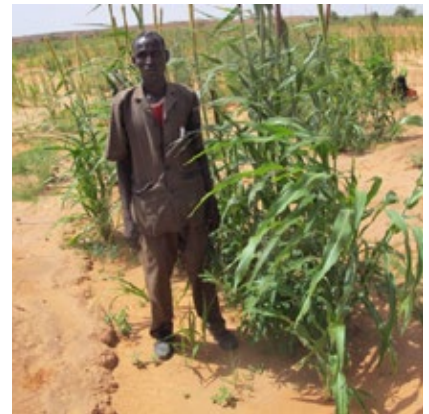
A beneficiary of the cash-for-assets program stands with his millet crops.

The ability of USAID to program both cash and commodities in these situations is critical to the program’s impact and strengthening resilience in the long term. Delivering lifesaving aid in a way that helps communities help themselves aims to promote self reliance and reduce their need for future food assistance.