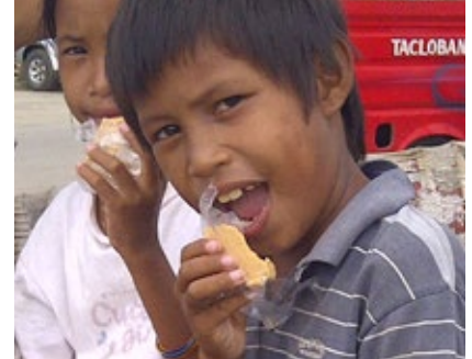
Children in Leyte eating meal-replacement emergency food bars.

The situation in the Philippines highlights the importance of a putting forth a multi-faceted disaster response.