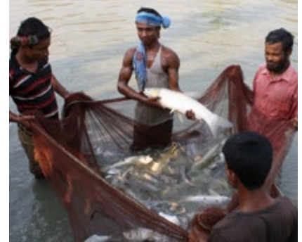
Farmers harvest their fish for sale in the market.

In Bangladesh, this partnership is helping fish farmers mitigate the immediate threats of poverty while also linking them to higher-quality fish that can help them access commercial markets. It’s a collaboration that has already benefited more than 34,000 households and 150 commercial fish farms—numbers that continue to increase every day.