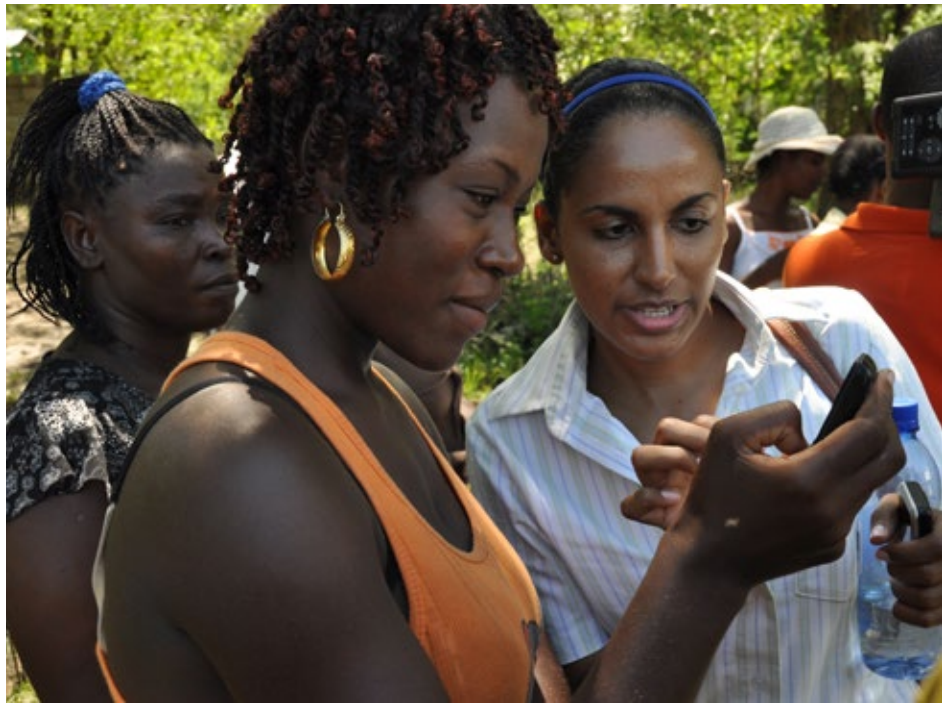
Mercy Corps staff showing beneficiaries how to use e-vouchers.

RESULTS: 170,000 people were able to purchase rice, corn flour, cooking oil and beans from their local markets. More than $8 million was injected into the Haitian economy as a result of people buying locally and engaging in mobile banking.