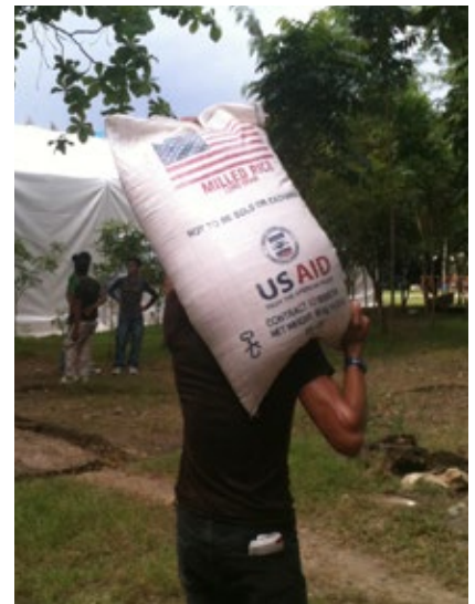
Volunteers unload a truck full of rice for distribution in Cebu. PHOTO