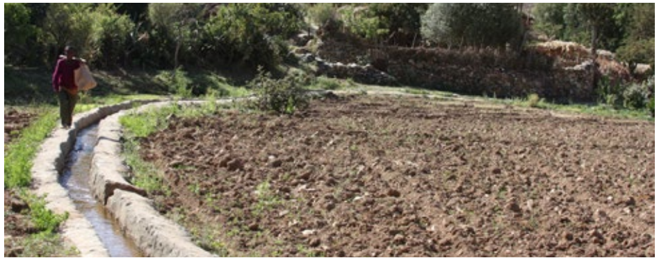
Community built irrigation canal.

RESULT: More than 545 watersheds were built in Tigray and more than 27,000 people graduated from the PSNP.