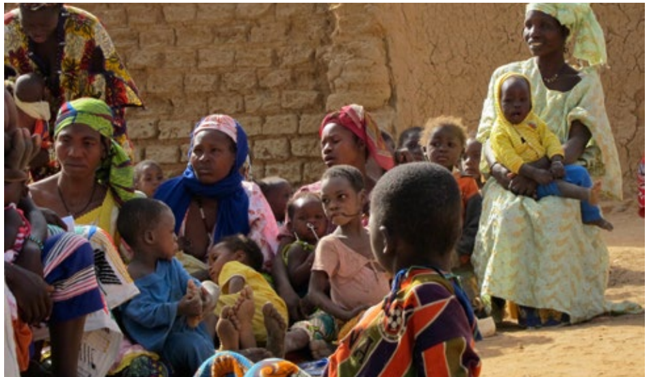
Mothers and children gathered for a community meeting.

RESULTS: The project helped rehabilitate 746 underweight children, taught mothers proper hygiene practices and food preparation, and revitalized a community safety net to sustain these gains in food security.