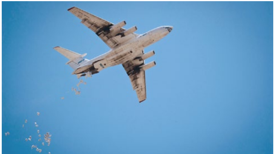
WFP airdrops critical food assistance in South Sudan.

RESULT: South Sudanese have received life-saving food and nutrition assistance.