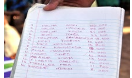
VSL members have their savings recorded in a ledger kept by the VSL group's secretary.

[This article first appeared in the March/April 2014 issue of FrontLines magazine.]