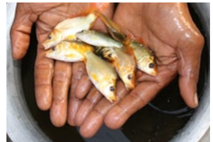
Fingerlings raised by the fish hatchery.