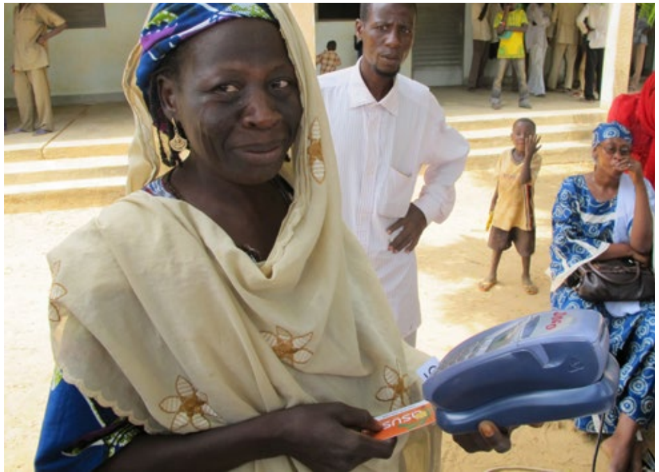
A program beneficiary uses her money to make a purchase.

RESULT: Over 2.2 million beneficiaries received food assistance from WFP during the 2013 lean season, improving food security and reinforcing the local economy.