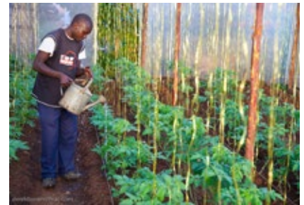
A farmer in Kathemboni tends to his beans using the new skills he has learned.

“We started work on this site in May of this year,” she says. “We started by planting kale, spinach, tomatoes, onions and maize. We benefit from this project. First, we eat the vegetables at home. And we also sell some of the foods.” She adds that “Our plan is to expand this project. We'd also like to involve more community members, especially those who cannot work. We'd like to include them in the project and make sure they do not go hungry.”