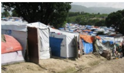
Tent camps after the 2010 Haiti earthquake.

After the devastating 2010 Haiti earthquake, an innovative, first-of-its-kind electronic voucher (e-voucher) food assistance program helped meet the food needs of recovering Haitians.