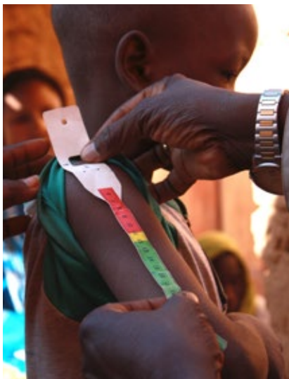
Child having his arm measured for malnutrition.

Katouma lives in the Ségou region, plagued with the highest prevalence of acute malnutrition in southern Mali. In 2013, an estimated 11.9 percent of children under 5 suffered from acute malnutrition. To address these challenges, USAID supports this development food assistance program implemented by Catholic Relief Services to improve nutrition and reduce food insecurity.