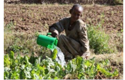
PSNP participant benefits from watershed irrigation works. PHOTO

The program, which focuses on various ways to rehabilitate natural resources, is currently being implemented in 545 watersheds across Tigray to help bring sustained relief to more than 705,000 people. In Mereb Leke alone, from 2009 to 2012 more than 27,000 people have graduated and can meet their food needs year round.