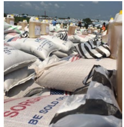
Distribution of food in Juba.

[First published in USAID's Impact Blog, June 13, 2014, written by Dina Esposito]