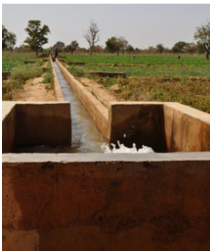
Irrigation system built by community members with USAID support in Rassomde.

Instead of digging traditional, impermanent trenches, community members built 400 meters of cement irrigation canals through a Food for Work activity. Over time they dug additional smaller irrigation canals. With four motor pumps for the canals purchased by Africare at a government-subsidized price, farmers increased crop production after only their first harvest.