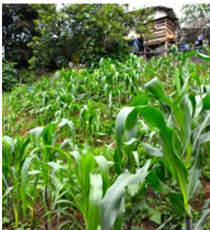
Sheny's home garden, where she is currently growing maize. PHOTO