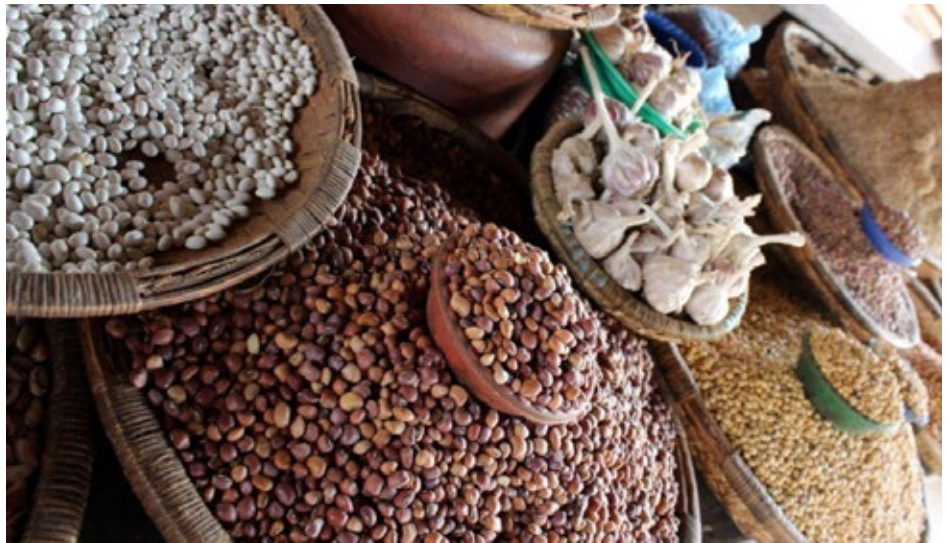
Beans being sold at market.

RESULTS: Farmers increased their food production and living standards through the additional income, while feeding refugees in need of emergency assistance faster and at a lower cost. WFP and USAID saved $240 per metric ton on corn and $900 per metric ton on beans.