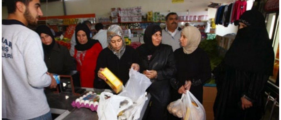
Syrian refugees shop on November 27, 2012 at the Oncupinar camp in Kilis, southern Turkey.

RESULT: Refugees have regained some sense of normalcy by buying their food in Turkish marketplaces, bolstering the local economy.