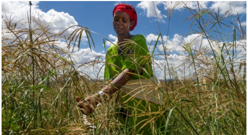
One of the beneficiaries of the improved irrigation system harvests her grass.

RESULTS: Workloads were reduced and economic opportunities increased for women farmers.