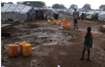
Protection of civilians site in Bor, South Sudan.

“At the U.N. compound in Bor, I saw where thousands of people have sought shelter and protection as fighting has devastated their homes and livelihoods.”