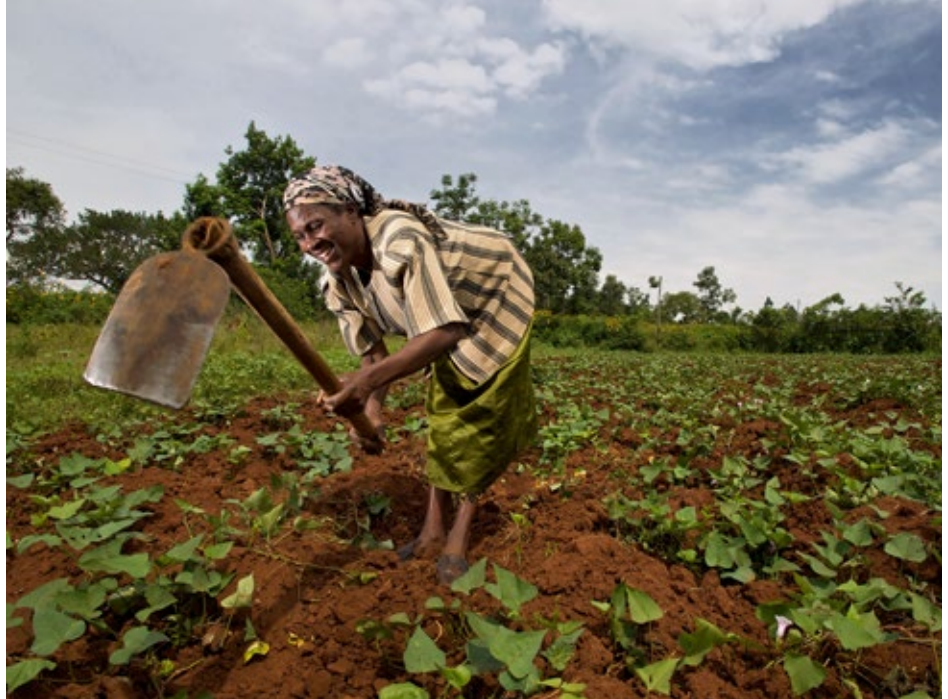
A beneficiary of the WFP program uses the new agriculture techniques she learned on her farm.

RESULT: Through more than 700 resilience-building projects, farmers improved their use of water and produced more food.