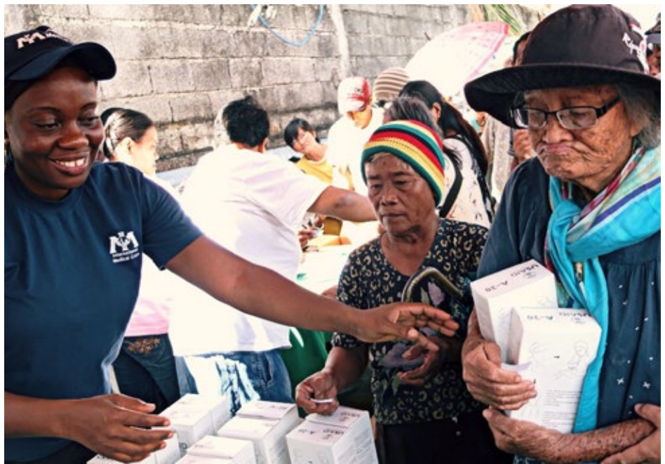
A WFP staff person distributes A-20 paste to beneficiaries.

RESULTS: 2.5 million of the most vulnerable received emergency food assistance in the wake of the typhoon.