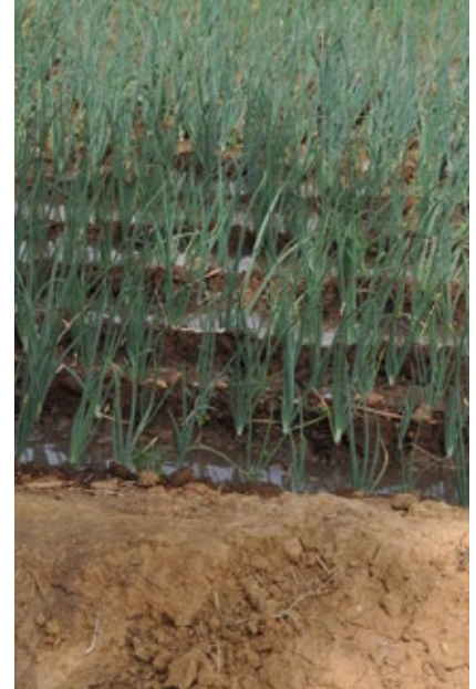
Onion crops ready for harvesting.