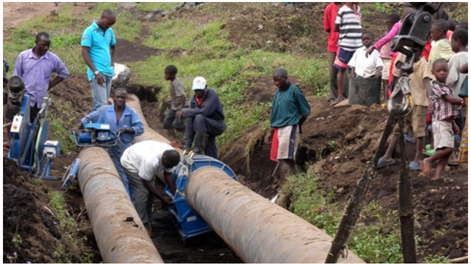
Workers fuse pipes together in Goma.

RESULTS: 250,000 people have gotten access to clean water.