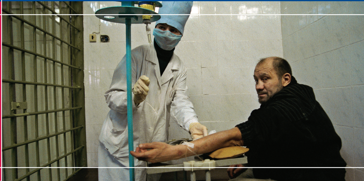
Prisoner with Tuberculosis in Matrosskaya Tishina, Moscow's main prison.