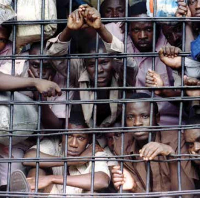
Aid efforts help facilities such as Gitarama Central Prison in Kigali, Rwanda, which is designed to house 500 prisoners, but at one time held up to 6,000, and where one in eight prisoners dies of disease or violence.