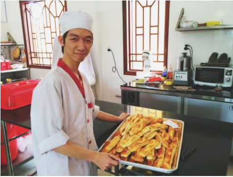
This young man is receiving professional training in baking at the Thanh Tam Special School in Danang, a partner of USAID PDSP.