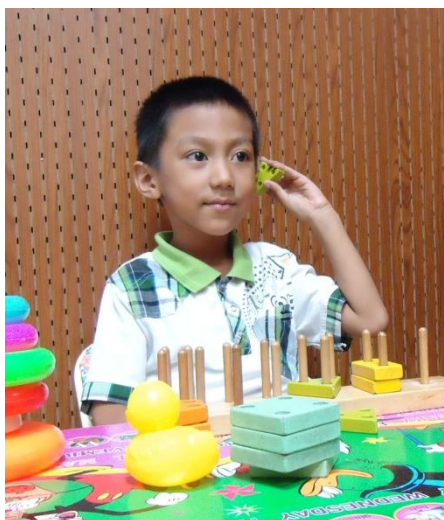
This young boy is testing his new hearing aids, received from DSP.

The USAID People with Disabilities Support Program is a three-year program focused on meeting the short- and long-term needs of people with disabilities in Vietnam. The program, also known as PDSP, started in October 2012. The two main components of the program are providing direct assistance to people with disabilities (PWDs) and capacity building for local government and NGOs to build a sustainable support network for PWDs.