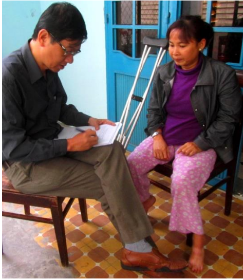
This woman is providing her feedback recorded on the medical and vocational support she received from PDSP. The project uses scorecards to solicit feedback and assess quality of support.