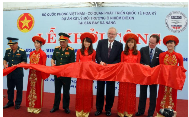
Ribbon Cutting at the Environmental Remediation of Dioxin Contamination at Danang Airport Project Launch.

Decades after U.S. engagement in armed conflict ended in Vietnam, hundreds of thousands of Vietnamese soldiers remain unfound or unidentified. The GVN estimates 650,000 soldiers are still missing in action. The U.S. Government has committed resources to helping the GVN locate or identify these lost persons.