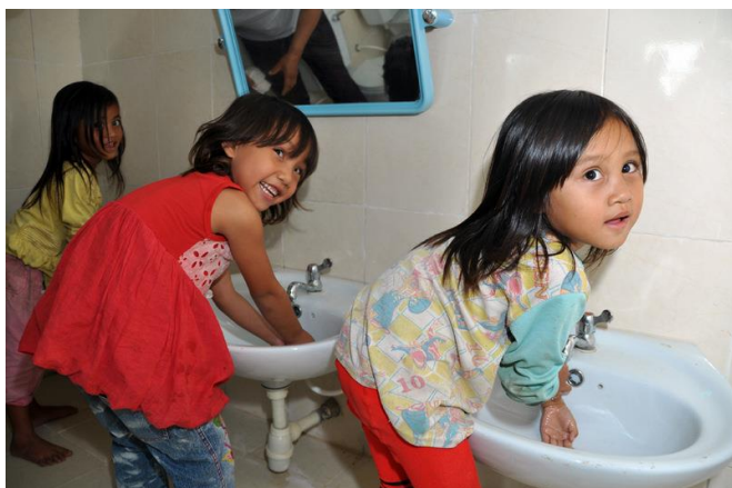
USAID supports early childhood development and kindergartens in the Central Highlands.

private sector to expand market based, economic opportunities for vulnerable populations, including ethnic minorities, the poor, particularly poor women and youth, as well as people living with disabilities or infected with HIV. This may include workforce skills development, access to finance, Micro-and-Small Enterprise technical assistance and other private sector value chain-based