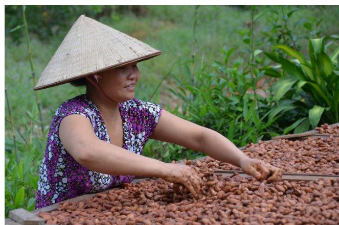
Farmers and their families in rural, central Vietnam profit from cocoa farming with USAID-sponsored training and support.

Most minority groups remain the poorest of Vietnam’s poor. As stated in a development partner document, “Although Ethnic Minority (EM) groups make up less than 15 percent of the population, they accounted for 47 percent of the poor and 68 percent of the extreme poor in 2010 – and the gap between minority populations and the Kinh majority continues to widen. The task of poverty reduction and achievement of inclusive growth will remain incomplete unless poverty among ethnic minorities [and land issues] are given sustained and focused attention.” Under IR 2.3, USAID will also engage in partnerships with the