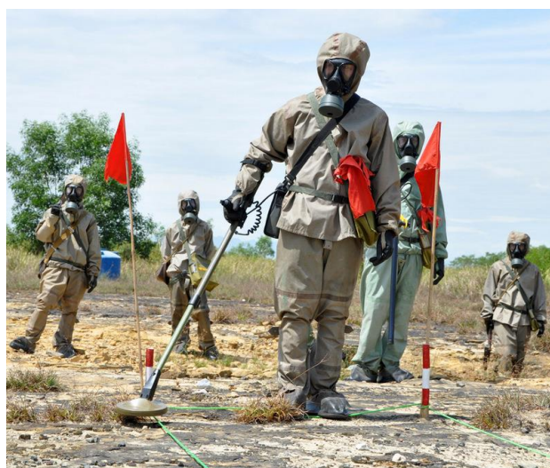
A Vietnamese soldier demonstrates UXO detection and clearance in Danang.

Vietnam has established a national-level strategic framework to address the complex and challenging problems associated with ERW with U.S. support. The U.S. continues to support direct service delivery for removal and disposal of UXO, risk education for vulnerable populations, and assistance to impacted persons in Vietnam's most heavily contaminated regions along the former demilitarized zone (DMZ). This direct support addresses immediate needs while modeling a proven comprehensive approach to dealing with ERW for the Vietnamese government. We also support enhancing the capacity of Vietnam's national authorities to plan, manage, and implement Vietnam's self-funded efforts to address ERW contamination.