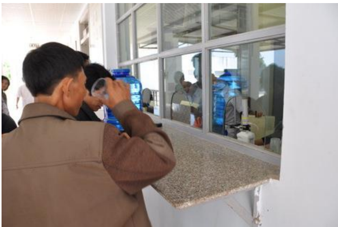
USAID supports methadone maintenance treatment in Dien Bien.

USAID's contribution to the interagency efforts to fight HIV/AIDS will be focused in three areas: