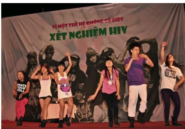
USAID and PEPFAR supports an outdoor concert to promote Vietnam's national action month for HIV/AIDS.

Vietnam has a concentrated epidemic among injecting drug users (IDUs), men who have sex with men (MSM), and sex workers (SW) and their clients. National HIV prevalence rates among the general population of 15-49 year olds is 0.43 percent. The 2009 HIV/STI Integrated Behavioral and Biological Survey (IBBS) Round II and sentinel HIV surveillance estimate that as many as 40 percent of the estimated 220,000 (range: 100,000-335,000) injecting drug users (IDUs) are infected with HIV. Injecting drug use is the leading driver in the transmission of HIV in Vietnam. There is also growing recognition of the HIV epidemic among MSM, with HIV prevalence among MSM in Hanoi and Ho Chi Minh City being estimated as high as 16 percent.