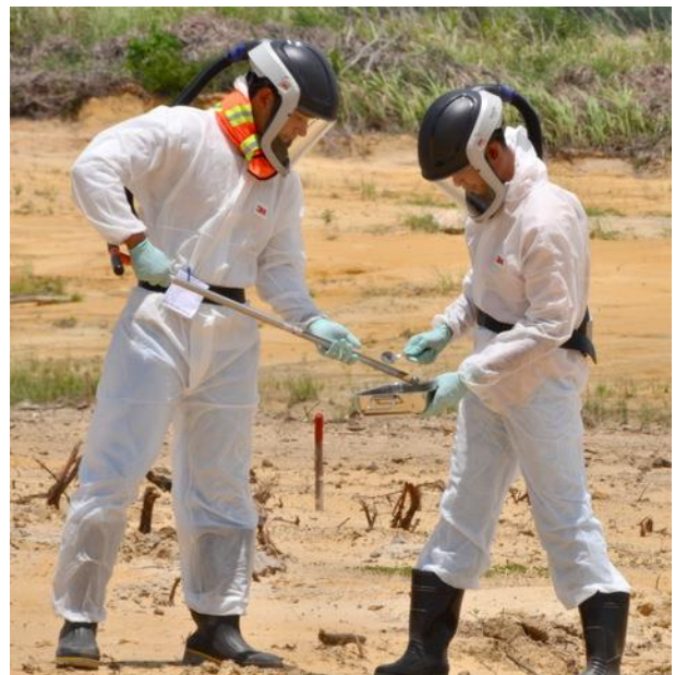
Soil sampling on the Environmental Remediation of Dioxin Contamination at Danang Airport Project site.

USAID will continue to work with its GVN counterparts to complete remediation of the Danang Airport site, as well as conduct a site-wide, comprehensive study of the Bien Hoa site. In harmonization with capacity- building activities, USAID’s dioxin projects will alleviate tension around the Agent Orange issue while building relevant competency in Vietnam with regard to environmental assessments and remediation activities.