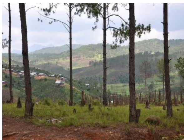
Forest degradation in Vietnam.

Due to extreme vulnerability to climate change impact, the GVN views climate change as one of its central development challenges and has identified climate change as a priority area for development assistance. GVN's climate change National Target Plan focuses largely on adaptation. It prioritizes water, agriculture, marine and coastal systems as most sensitive, and in particular prioritizes the need for adaptation action in the Mekong and Red River Deltas. The National Strategy for Climate Change Adaptation, ratified in 2011 has objectives to ensure there is enough food and water, while reducing poverty and gender inequality and protecting natural resources; enhance the stakeholders' awareness, responsibility, and capacity to cope with climate change; and have Vietnam contribute to the international community's efforts to deal with climate change.