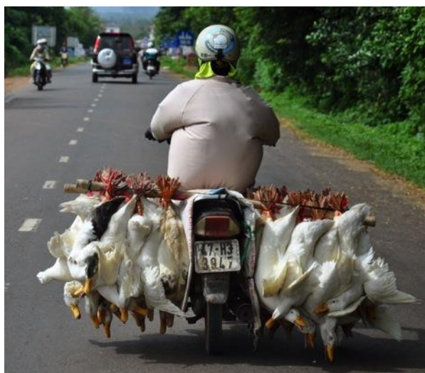
Vietnam is considered a “hot spot” for avian influenza and the emergence of other diseases.

Vietnam is one of four countries globally with endemic highly pathogenic avian influenza (HPAI) causing regular outbreaks in poultry (over 3,000 outbreaks and more than 40 million poultry culled to-date) and dangerous human cases (123 of which 61 have been fatal). The HPAI virus continues to evolve and pose a public health, animal health and economic threat.