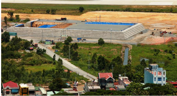
The pile structure for thermal desorption treatment of dioxin contamination at Danang Airport.

complex and challenging problems associated with ERW with USG support.