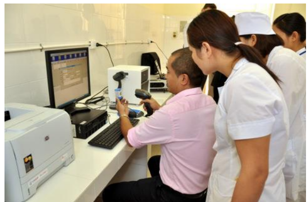
USAID supports provision of rapid TB detection equipment and training in Dien Bien.

USAID will work in cooperation with U.S. Department of Defense (DOD) Cooperative Threat Reduction (CTR) Cooperative Biological Engagement Program (CBEP) and the Defense Threat Reduction Agency (DTRA) to build disease detection and surveillance capacity and develop laboratory capabilities tied to biological safety and security in conjunction with appropriate GVN ministries including the Ministry of Health and the Ministry of Agriculture and Rural Development. The skills and resources DTRA provides will strengthen existing relations with GVN ministries and local authorities to prevent and remedy public health threats.