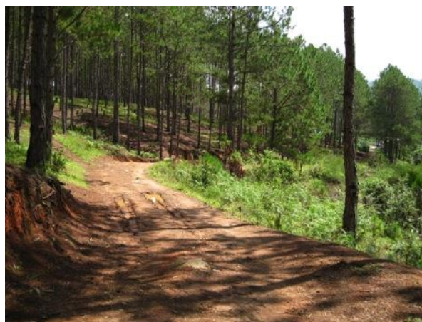
Tropical forests in Vietnam.

As of 2005, approximately 37 percent (12 million ha) of the country's total land area was classified as forested land, including roughly 10 million ha of natural forest and two million ha of plantation forest. Natural forest vegetation has declined dramatically in quantity and quality during the past 50 years. Government recognition of this trend led to new efforts at forest protection in the mid-1990s and has resulted in an increase in forest cover in recent years. However, a majority of recently reforested area is in monoculture plantation forest; intact primary forest remains today only in small, isolated remnants in the high mountains. Vietnam has a system of protected areas – which it designates as 'special-use' forests – including 126 sites with a total area of approximately two million ha. The country has five Ramsar sites, two UNESCO Natural World Heritage Sites, eight UNESCO Biosphere Reserves, and four ASEAN Heritage Parks. With these efforts, Vietnam has placed each of its major forest ecosystem types under protection. Despite these encouraging efforts, deforestation continues at rates not reflected in official statistics and illegal logging continues with large tracts of forests being lost.