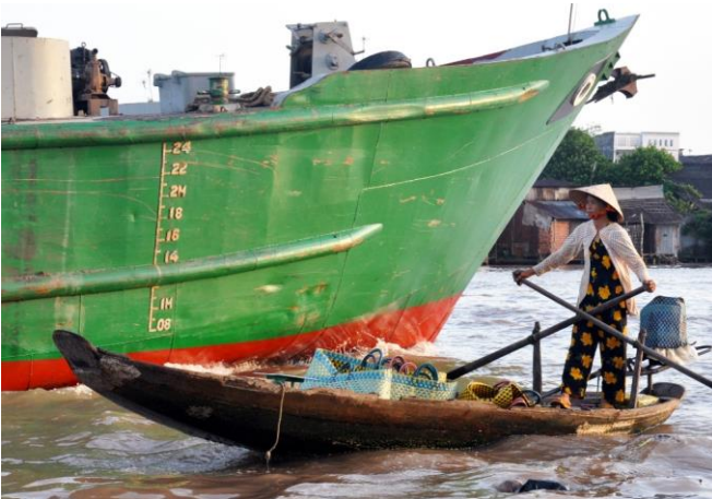
The country's large population centers and key agricultural sectors are especially exposed to rising sea levels and increased storm risks in low-lying deltas and on its long coastline.

Over the past decade, Vietnam has made significant yet uneven progress in the economic and social sectors. Achievements in health care and education include increased enrollment in primary education and increased accessibility of public health resources. However, adequate country capacity 20 (human, public sector, private sector, NGO) is one of the critical missing factors in current efforts to meet the Millennium Development Goals (MDGs). 21 Development efforts in many countries will fail, even if they are supported with substantial funding, if the development of sustainable capacity is not given greater and more careful attention. This principle is generally well known and recognized by donor organizations and partner countries alike, and is articulated in the 2005 “Paris Declaration on Aid Effectiveness.”