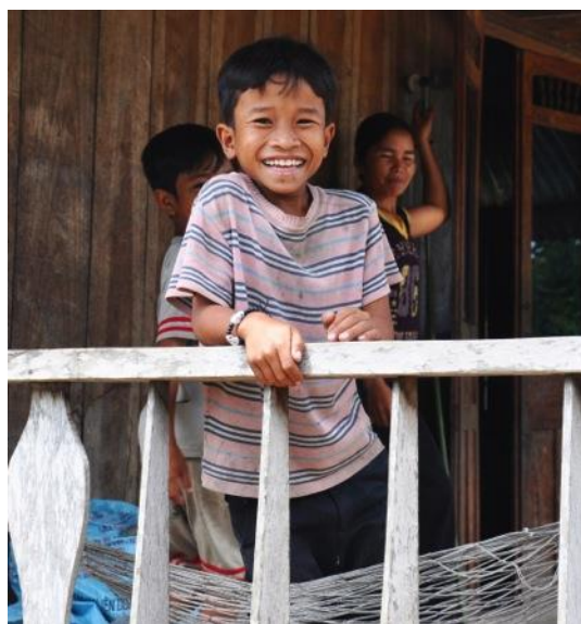
A school child in the Central Highlands province of Dak Lak.

Inclusiveness in the development literature is increasingly being used to convey both political and economic participation. The ADB paper, a Framework of Inclusive Growth Indicators 2012 , defines inclusive growth as economic growth with equality of opportunity and notes that policies for inclusive growth are supported by good governance and institutions (Note: See graphic below. Although the Mission does not anticipate integrating all aspects of the model into the CDCS, it provides a good basis for the linkages between inclusiveness, growth, and good governance). Importantly, this model links good governance and human capacity as essential elements of inclusive growth. The ADB has shown, for instance, that good governance (as measured via the CPI or other indicators) is correlated with inequality in incomes and educational attainment. Additionally, inclusive development partnerships are a key element of the Busan Partnership Document and in the localization of those principles through the Vietnam Partnership Document (VPD). The VPD contains perhaps the best description of inclusive development, defining it in terms of expanding partnerships with civil society, expanding partnerships with the private sector, ensuring gender equality and women’s empowerment.