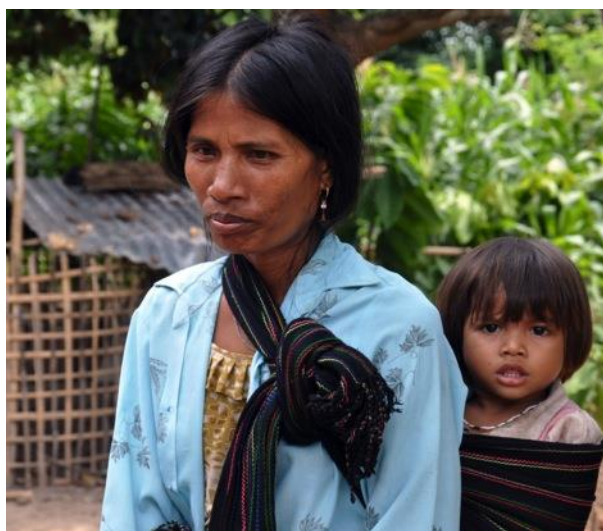
The poverty rate in Vietnam's rural areas is considerably higher than that of the urban areas.

Labor: The Vietnamese government will need to create a more enabling environment for operation of associations and enable collective bargaining to successfully close the TPP labor chapter. The congressionally-mandated Trafficking Victims Protection Reauthorization Act (TVPRA) list brought increased attention to the use of child labor and forced labor in Vietnam. 3 The U.S. Department of Labor and Department of State fund eight labor-related projects in Vietnam with the overarching goal of improving working conditions for Vietnamese.