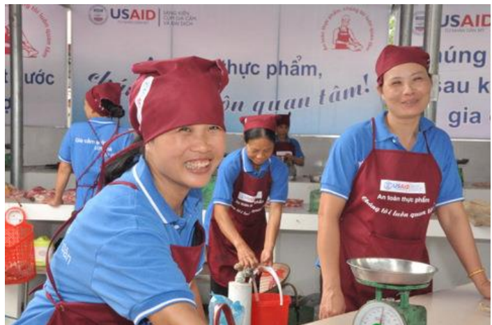
USAID supports the upgrade of Hoa Mac poultry market in Ha Nam province.

Vietnam is one of four countries globally with endemic highly pathogenic avian influenza (HPAI) causing regular outbreaks in poultry (over 3,000 outbreaks and more than 40 million poultry culled to-date) and dangerous human cases (123 of which 61 have been fatal). The HPAI virus continues to evolve and pose a public health, animal health and economic threat. HPAI remains endemic and many challenges remain, most notable of which is a farming and food supply system conducive to fostering the emergence of a lethal animal virus or pathogen to become easily transmitted among humans. Critical to combating these challenges will be to continue strengthening the capacity of the Ministry of Agriculture and Rural Development and Ministry of Health to build systems that adequately address the challenges of existing and emergent diseases.