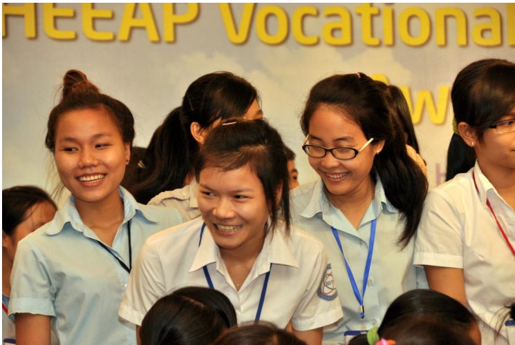
Female engineering students in Ho Chi Minh City received scholarships under the Higher Engineering Education Alliance Program supported by USAID and its industry partners.

education in Vietnam are public and suffer from hampered governance, we have learned that university and vocational school leadership yearn to innovate and can find ways to do so.