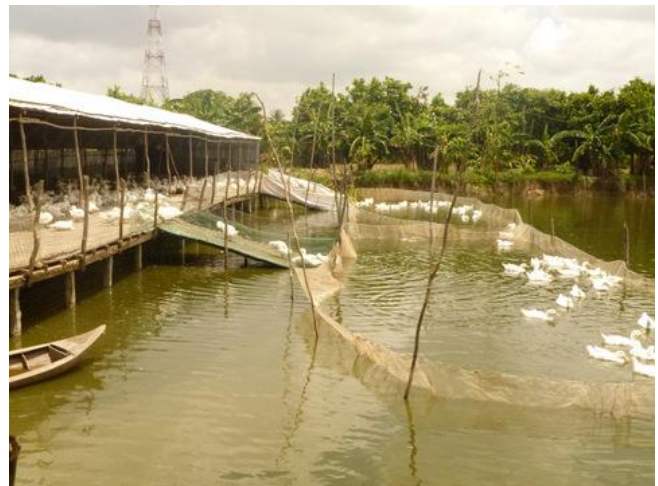
A duck farm in the Mekong Delta province of Can Tho.

Climate change is only one of several key areas to which Vietnam's population is vulnerable. The country is currently facing a double burden of disease, with increases in the share of morbidity and mortality from non-communicable diseases, accidents and injuries, along with the continued threat from communicable diseases, which require significant resources from the government. HIV/AIDS prevalence still remains a significant public health issue amongst targeted populations, as has dengue fever prevalence in the Mekong Delta, malaria in the Northern Mountains and Central Highlands, and tuberculosis in the South, including the emergence of multi-drug resistant tuberculosis (MDR-TB). Emerging pandemic threats, such as the currently endemic avian influenza, or the more recent H1N1 influenza outbreak, pose further great challenges to the human and animal health systems.