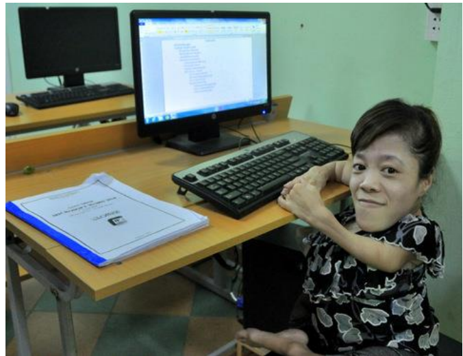
The USAID-supported training program for people with disabilities has trained approximately 1,000 young Vietnamese with disabilities on IT skills, soft skills, and job search skills; 85% of the students trained in advanced IT skills have found jobs.

Persons with disabilities account for as much as 15 percent of Vietnam’s population. 23 A vast majority of persons with disabilities live in rural areas and attend school at rates far below those of non-disabled persons. Literacy rates are much lower for adult persons with disabilities than those without disabilities. In the world of work, few persons with disabilities have stable jobs and regular incomes. As a group, they have lower labor participation rates and higher unemployment rates in both rural and urban areas than people without disabilities. The National Coordinating Council on Disability has limited authority to influence other ministries beyond MOLISA thus limiting government-wide coordination on what should be identified as a cross-cutting matter. Additionally, disability policies meant to further integrate and advance the needs of persons with disabilities are neither adequately enforced once passed into law nor disseminated to local government offices and officials. Additionally, funding and government capacity remain an issue and disability programs that do exist in Vietnam, cover persons with mobility, vision, and hearing impairments, but are new to the issues of developmental disabilities.