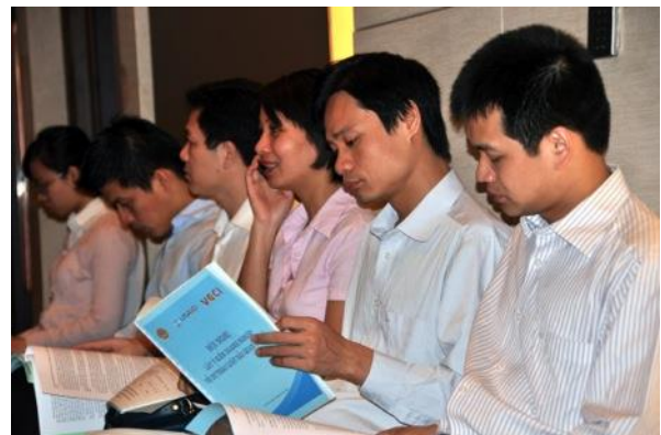
USAID supports a consultation workshop with business representatives on Vietnam's revised Customs Law.