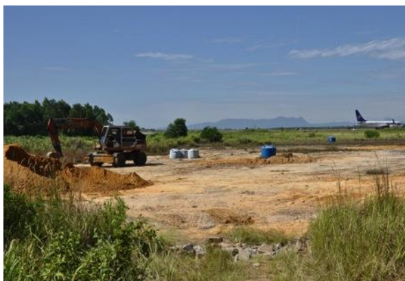
Areas at Danang International Airport have been referred to as a dioxin "hotspot" due to the high dioxin concentrations in soil and sediment.

One of the most significant remaining Vietnam War legacy issues is Agent Orange. Former U.S. airbases, including Danang, Bien Hoa, and Phu Cat have been referred to as dioxin "hot spots" due to high dioxin concentrations remaining decades after large volumes of Agent Orange and other defoliants were handled at these sites during the Vietnam War. High-level U.S. foreign policy objectives in Vietnam include resolving the Agent Orange issue, and in 2008, the USG and the GVN agreed, as their top priority on remediation efforts, to focus on Danang.