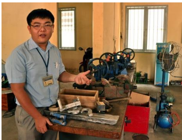
A mechanical lab in Ho Chi Minh City University of Technical Education.

USAID conducted assessment work that identified tertiary workforce development as a strategic goal, falling in line with some of Vietnam’s most pressing needs. Priority areas include more access for underserved and disadvantaged groups, improved quality of tertiary education and improved relevance and quality of work force development programs.