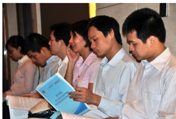
USAID supports a consultation workshop with business representatives on Vietnam's revised Customs Law.