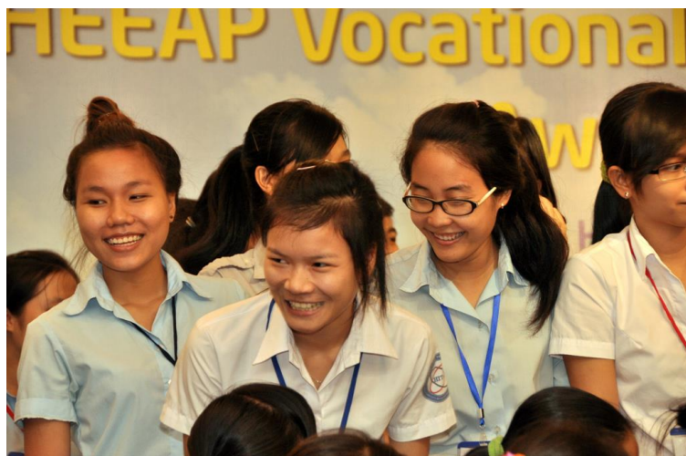
Female engineering students in Ho Chi Minh City received scholarships under the Higher Engineering Education Alliance Program supported by USAID and its industry partners.

education in Vietnam are public and suffer from hampered governance, we have learned that university and vocational school leadership yearn to innovate and can find ways to do so.