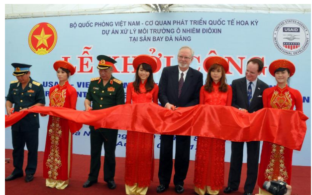
Ribbon Cutting at the Environmental Remediation of Dioxin Contamination at Danang Airport Project Launch.

Decades after U.S. engagement in armed conflict ended in Vietnam, hundreds of thousands of Vietnamese soldiers remain unfound or unidentified. The GVN estimates 650,000 soldiers are still missing in action. The U.S. Government has committed resources to helping the GVN locate or identify these lost persons.