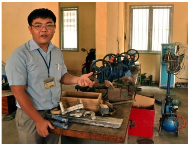
A mechanical lab in Ho Chi Minh City University of Technical Education.

USAID conducted assessment work that identified tertiary workforce development as a strategic goal, falling in line with some of Vietnam’s most pressing needs. Priority areas include more access for underserved and disadvantaged groups, improved quality of tertiary education and improved relevance and quality of work force development programs.