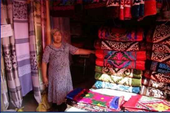
Small business owner in Southern Kyrgyz Republic who benefitted from USAID initiated Loan Guarantee Fund.

On December 31, USAID signed a loan guarantee program designed to encourage commercial lending to local entrepreneurs with Demir Kyrgyz International Bank and Bai Tushum Bank. Employing USAID's Development Credit Authority (DCA) -- which uses risk-sharing agreements to mobilize private capital -- USAID will guarantee 50% of loans made to small businesses operating in the