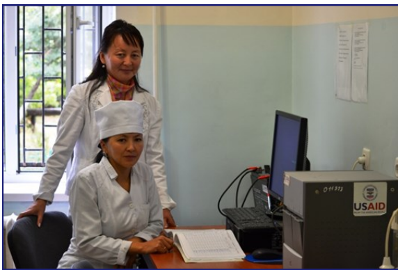
Staff at the Issyk –Ata FMC operating the GeneXpert® equipment.

In 2012, the USAID Quality Health Care Project initiated a pilot in the Issyk Ata rayon of Chui Oblast to introduce a new model of tuberculosis (TB) services at the primary health care level. The model focused on early detection and treatment of TB using new GeneXpert® technology, improved TB infection control measures, and updated clinical protocols based on international standards. The model also worked to improve patient adherence to treatment by facilitating patient-centered ambulatory treatment for those not requiring or desiring hospitalization.