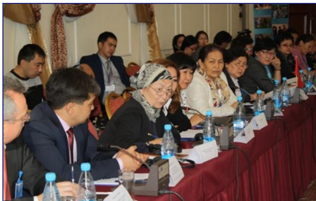
The Dialogue generated a heated discussion.

With USAID and IOM support, Government partners hosted a Dialogue on Implementation of the Law on Prevention and Combating Trafficking