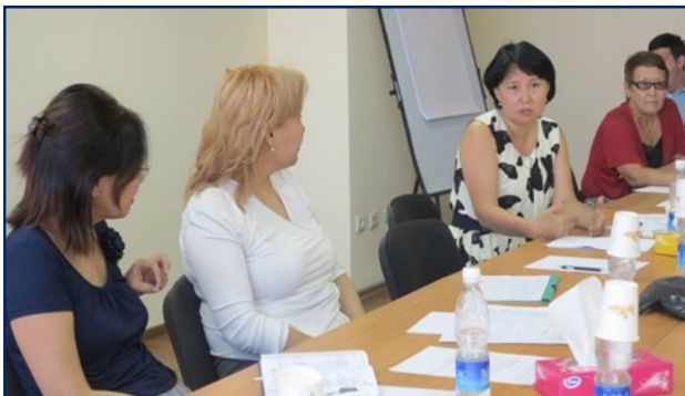
Ministry of Social Development staff discussing solutions.

USAID is continuing to support the Ministry of Social Development to implement performance solutions in its central office, as identified through an institutional performance gap analysis and workflow assessment. These identified solutions include the creations of system that will improve Human Resource