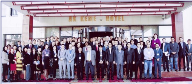
Workshop participants.

On December 18-20, USAID's Trade and Revenue project (ATAR) hosted a regional transport and logistics workshop in Bishkek, bringing together freight carriers, truck operators, freight forwarders, logistics service providers, as well as warehouse and storage operators from Afghanistan, India, Kazakhstan, Kyrgyzstan, Pakistan, Tajikistan, Turkmenistan, and Uzbekistan. More than 90 participants discussed current challenges and opportunities in the South and Central Asia regional system for movement and storage of goods including the International Road Transport