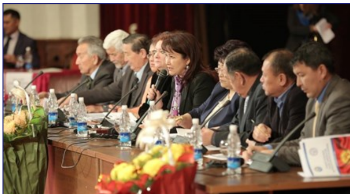
Deputy minister of Justice, Jyldyz Mambetalieva, is opening the Congress of Advocates.

Following the passage of the Law on Advocatura in July 2014, ABA ROLI, in coordination with the Ministry of Justice, United Nations Development Program, Soros Foundation, and GIZ, conducted six round tables throughout the country to present to the defense advocates