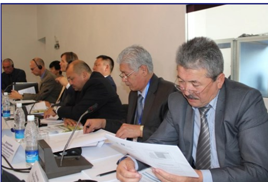
Participants at the October conference review the background materials before a discussion.

Implementing organization: Eurasia Foundation of Central Asia