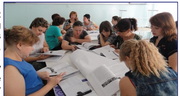
Teachers studying new reading instruction methods.

To learn more about this project click here .