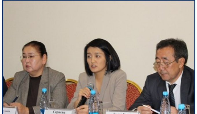
The roundtable on social procurement is opened by the Vice Prime Minister on Social Issues, Vice Mayor of Bishkek and Minister of Social Development.

To learn more about these programs click here and here .