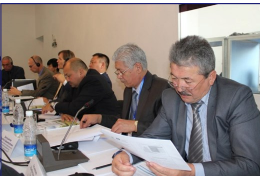
Participants at the October conference review the background materials before a discussion.

Implementing organization: Eurasia Foundation of Central Asia