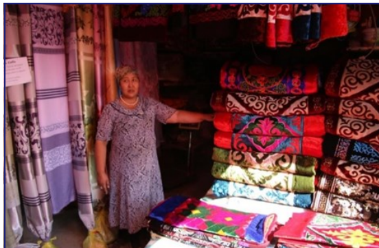
Small business owner in Southern Kyrgyz Republic who benefitted from USAID initiated Loan Guarantee Fund.

On December 31, USAID signed a loan guarantee program designed to encourage commercial lending to local entrepreneurs with Demir Kyrgyz International Bank and Bai Tushum Bank. Employing USAID's Development Credit Authority (DCA) -- which uses risk-sharing agreements to mobilize private capital -- USAID will guarantee 50% of loans made to small businesses operating in the