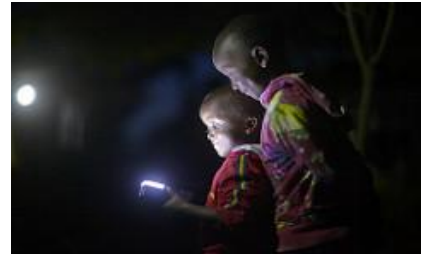
Power Africa supports Tanzania’s energy sector through transaction assistance for priority generation projects, technical support, and institutional capacity building. MATTHIEU YOUNG

Education: USAID’s education activities in Tanzania aim to improve early grade learning for 1.4 million primary school children by increasing the availability and use of quality learning materials, improving teacher skills and behaviors, and enhancing parental and community support in over 3,000 primary schools. This is complemented by annual reading and math assessments to track gains in learning and guide future strategy, policies, and programs. USAID also partners with local government authorities, school and community leaders, teachers, and parents to provide a holistic package of interventions to increase adolescent girls’ enrollment and retention in secondary school.