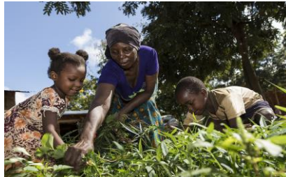
Feed the Future integrates women into agricultural value chains and ensures all household members benefit from expanded economic activities in Tanzania. USAID/TANZANIA