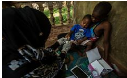
The President’s Malaria Initiative works with the Zanzibar Malaria Elimination Program to sustain gains in malaria control.

Energy: Tanzania is a focus country under Power Africa, a U.S. Government interagency initiative to double access to power in sub-Saharan Africa. In support of these efforts, USAID assists the Government of Tanzania in advancing private-sector energy transactions, as well as adopting and implementing the policy and regulatory reforms necessary to attract private investment in the energy and power sectors. Power Africa support also includes technical assistance to utilities, regulatory authorities, and government institutions to improve the feasibility of proposed energy projects, as well as capacity building to improve the public sector’s ability to engage with financial institutions and the private sector to finance power projects.