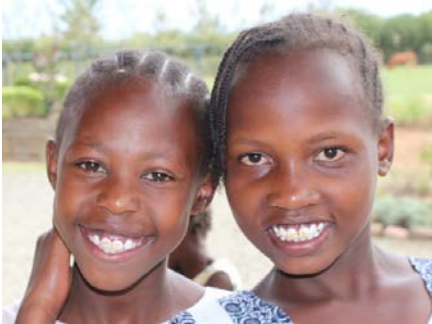
An example of friendship formed at the Mission in Africa Children's Home in Kisumu