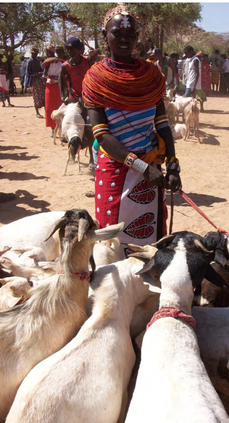
Women pastoralist selling goats on market day in Merille, Kenya

One of USAID Ethiopia's main resilience building programs is the five year, $53 million, Pastoralists Areas Resiliency Improvement through Market Expansion (PRIME) Program. Contracted in October 2012 and led by the NGO Mercy Corps, the program aims to reach 250,000 households in 3 regions of Ethiopia. The program has established offices, recruited and deployed