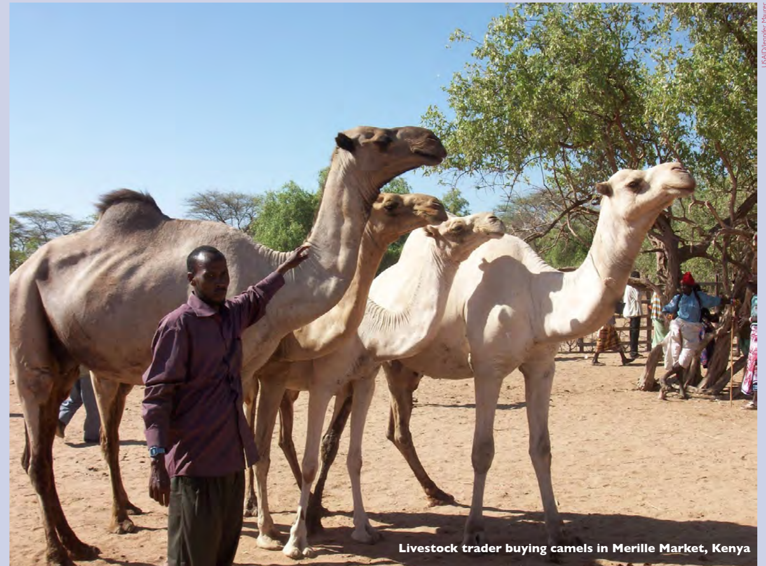
Livestock trader buying camels in Merille Market, Kenya