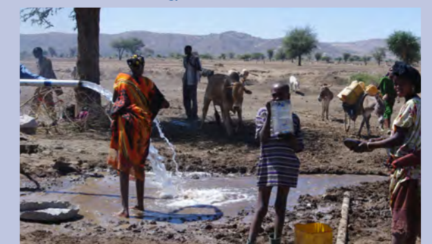
Newly drilled bore hole in Somali Region in Ethiopia

Prime will utilise and adapt novel tools such as the Emergency Market Mapping and Analysis (EMMA) Toolkit for this work. In the effort to improve productivity and market access for pastoralists, key players from production to processing to retailing will come together to agree on the demand, production parameters, growth, centers of excellence, competitive advantages, consumer trends, bottlenecks and incentives driving the value chain.