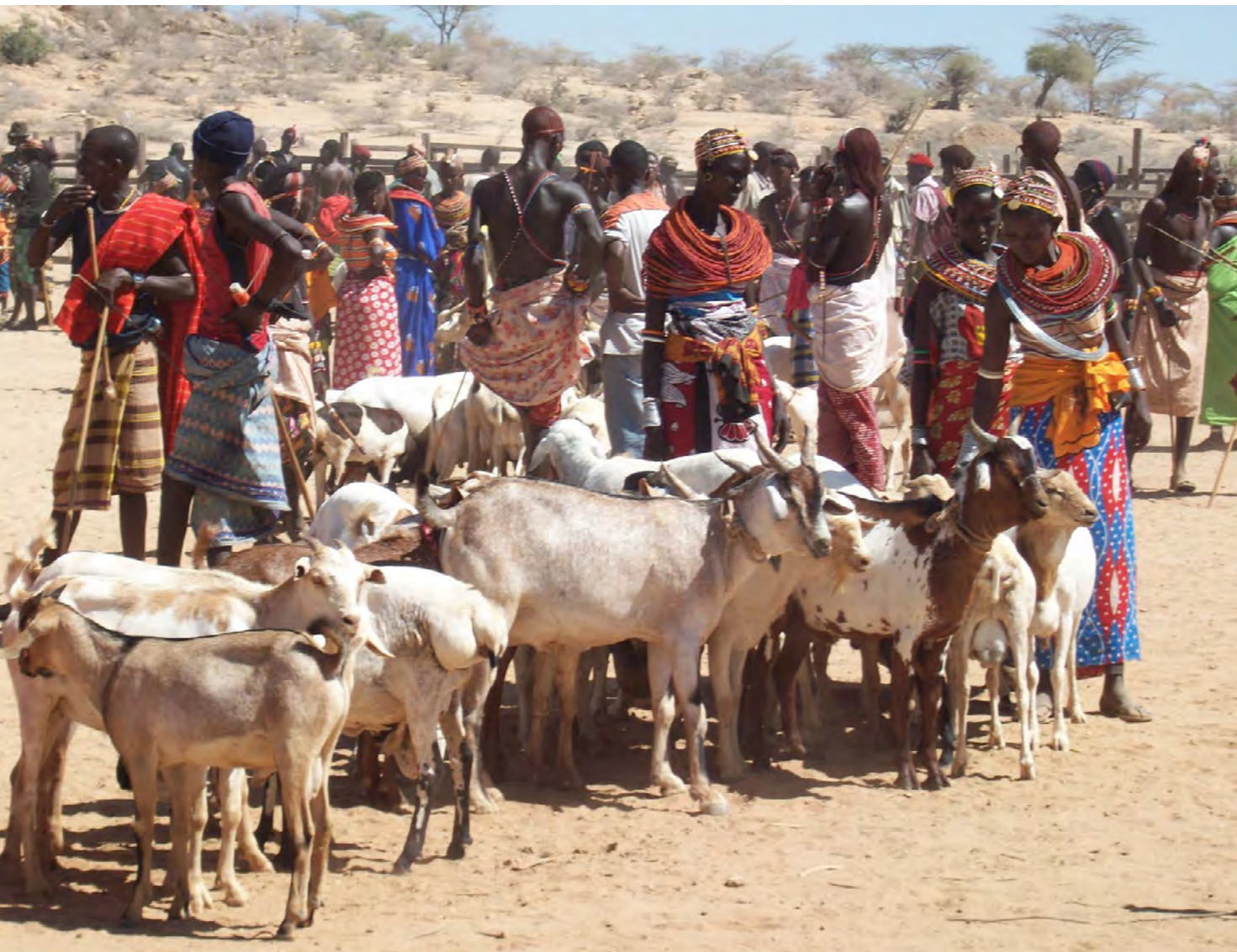
Market day at the Merille Livestock Market, Kenya

of Northern Kenya and Other Arid Lands. In addition to the Country Program Paper, a Sessional Paper on the National Policy for Sustainable Development of Northern Kenya and Other Arid Lands was approved by Parliament in December 2012. All these papers and in particular the CPP, subsequently informed the Government of Kenya's Medium Term Plan, 2013-2017 for Drought Risk Management and Ending Drought Emergencies. The plan details programs to be funded, policies to be changed and monitoring, evaluation and coordination mechanisms over the next five years. The plan forms the basis of a new social contract between central Government and dryland areas at a key stage in Kenya's constitutional development. The plans will be allocated a budget in June 2013.