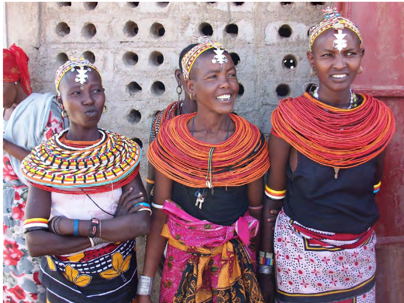
Women group at Merille, Kenya

both Ethiopia and Kenya suggested that field-level staff of partners or sub-contracted organizations would benefit from additional gender training and/or gender coaching or mentoring, and additional consideration should be given to hiring gender experts.