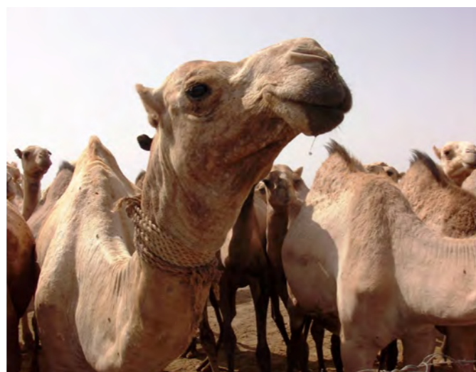
Camels watering at the rehabilitated springs in Kalacha, Kenya

The program recently agreed on 'Standard Methods and Procedures' for peste des petits ruminants (PPR), one of nine serious trade-related diseases that have been prioritized. In early 2013 experts from across the region comprising the Chief Veterinary Officers and Directors Veterinary Diagnostic Facilities, visited the United States to learn how U.S. disease control and traceability systems areas might be adapted for the Horn of Africa. AU-IBAR will shortly contract technical institutions to provide extensive management and technical training to senior animal health officials across the region.