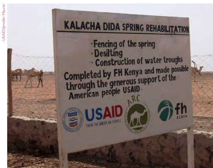
Kalacha DIDA Spring Rehabilitation site, Kenya