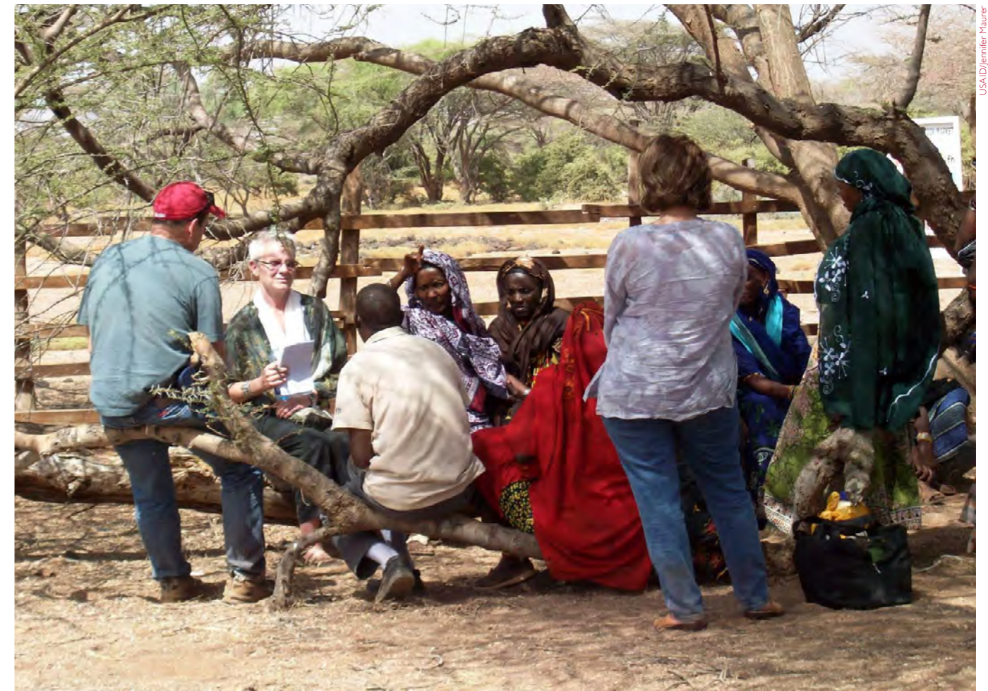
Gender focused discussion in Kalacha Market, Kenya

Sufficient technical skills related to gender gaps and gender relations are necessary for successful program implementation. Several observations of the team in