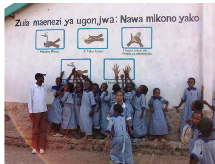
Pastoralist Girls School, Kalacha, Kenya