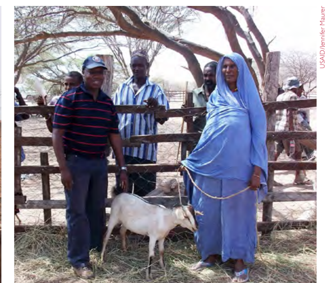
USAID's livestock specialists hold discussions with women livestock trader in Kalacha Market, Kenya