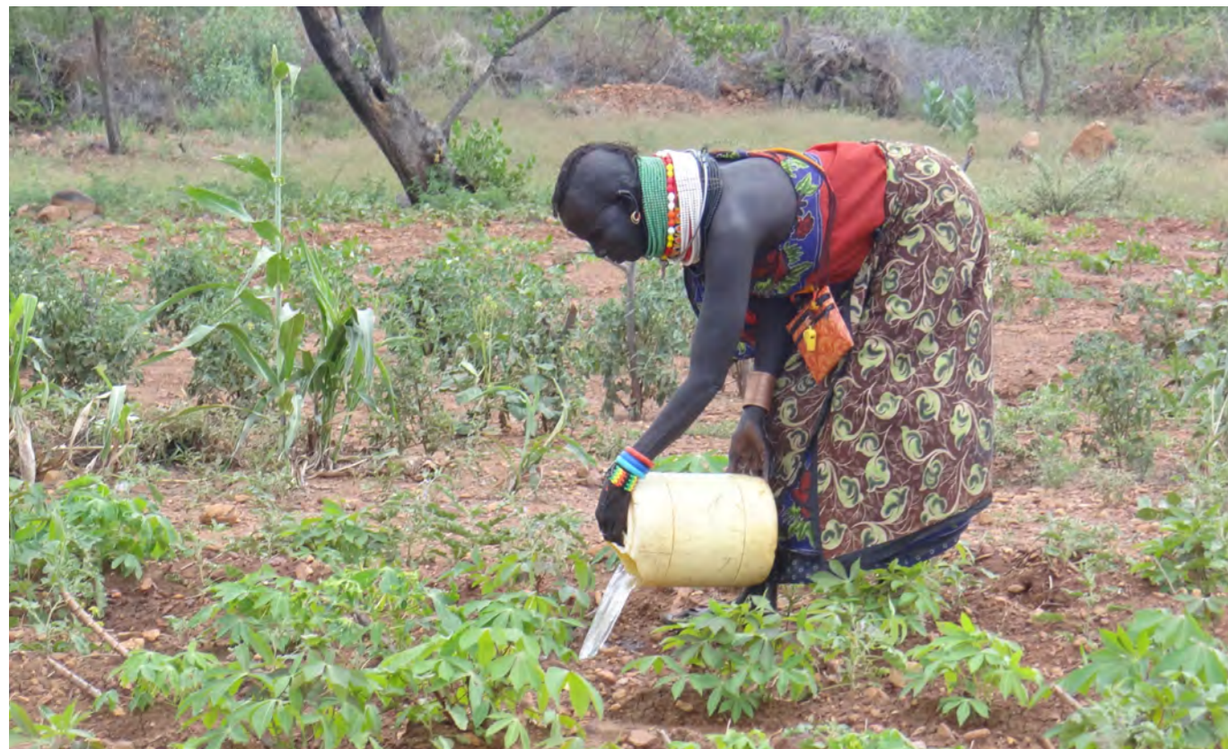
Turkana woman waters her crops

The Joint Planning Cell (JPC) for the Horn of Africa is a group from the East Africa Mission, USAID/Office of U.S. Foreign Disaster Assistance (OFDA), USAID/Food for Peace (FFP), and the Kenya and Ethiopia Missions. It meets on a regular basis to develop and plan for a set of new programs for resilience as well as better coordinate existing programs. In early 2012, a joint approach, and mission-specific action plans were approved by USAID Washington and in April 2012, Administrator Shah publicly announced a significant funding commitment to support this strategy.