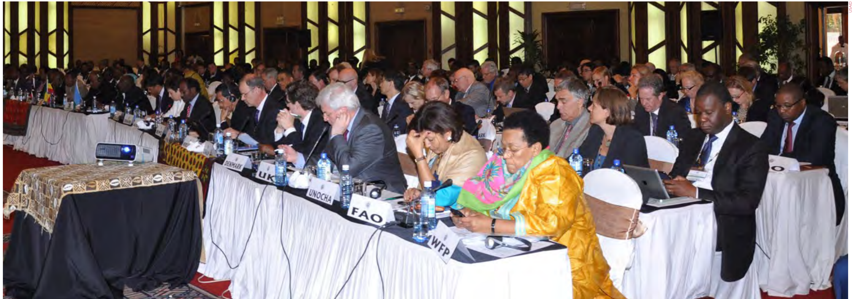
IGAD Ministerial and High Level Development Partners Meeting, Nairobi, Kenya April 2013

This report primarily describes the activities and achievements of USAID/East Africa, USAID/Ethiopia and USAID/Kenya on implementing the Horn of Africa (HOA)