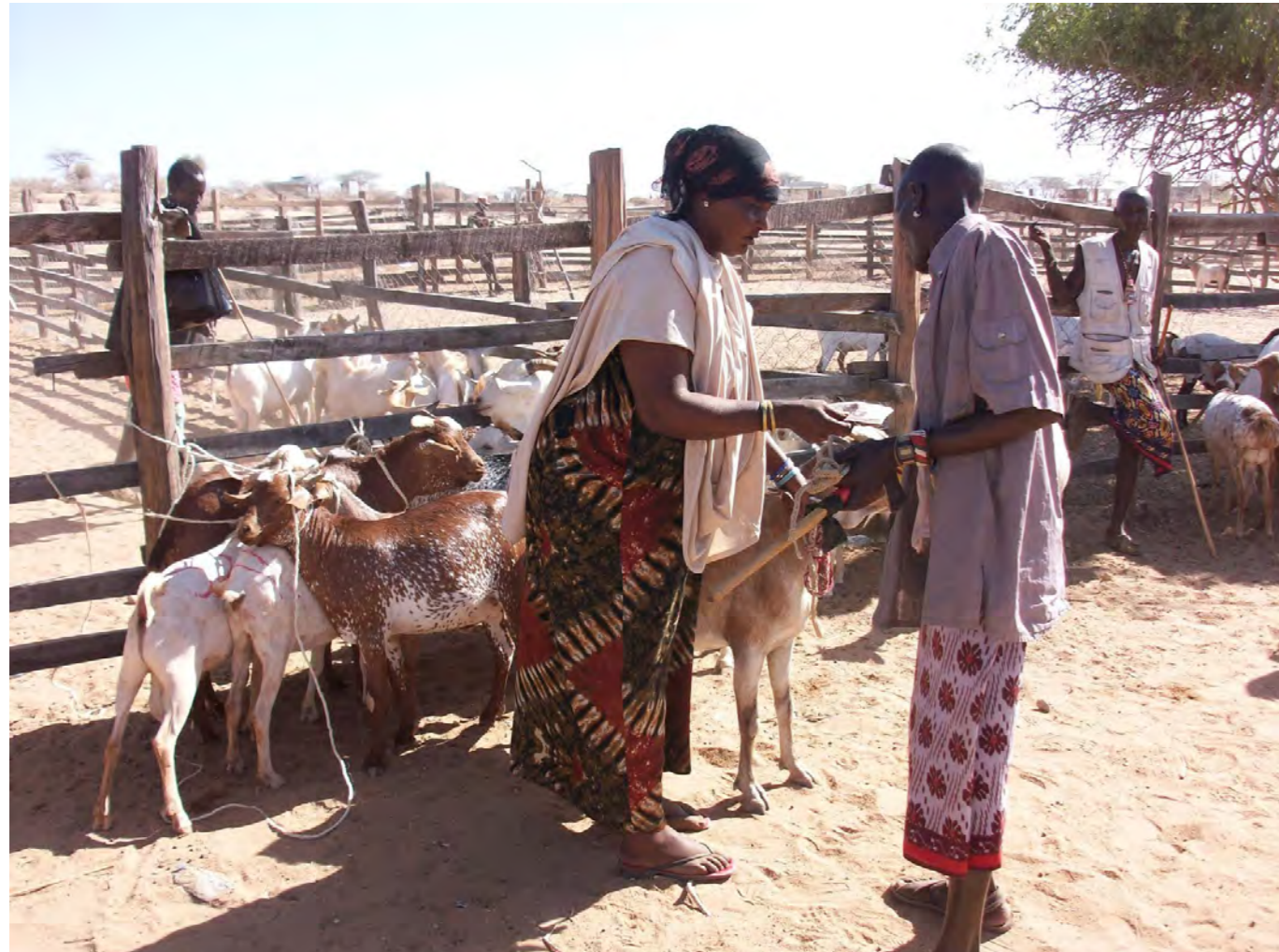
Women livestock trader completing a sale of goats at Merille Market, Kenya

Project in Gode Zone, Somali Region till 2014. The project complements the Sustainable Humanitarian Assistance Program for Ethiopia (SHAPE) implemented by Global Communities in Gode Zone. SHAPE included the development of Asset Building Groups. Each group consists of up to 80 members of a community that engage in a business venture that benefit from increased collective productive capacity and bargaining power. Over the past months, the Building Resilience Project has conducted participatory natural resources mapping for 13 project sites, and has supported cash-for-work natural resource rehabilitation activities, including prosopis clearing, grazing land rehabilitation and water scheme rehabilitation, for over 1700 beneficiaries. The program also supported a vaccination campaign which helped treat and vaccinate over 100,000 livestock against parasites, trypanosomosis and infectious diseases. USAID humanitarian funds have been allocated to the project till 2014 and it is planned that it will then be able to sequence into a development funded program.