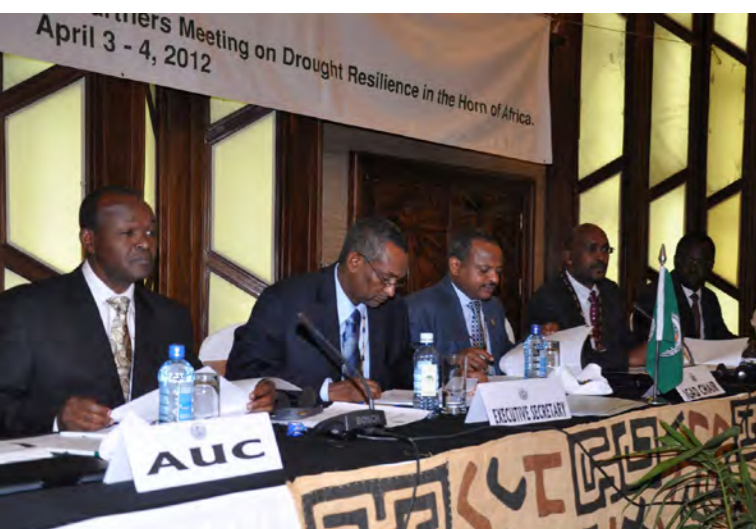
High table at the IGAD Ministerial and High Level Development Partners Meetings, Nairobi, Kenya April 2012

While conceived in the Horn of Africa, the Global Alliance now has two arms. The Horn of Africa arm is led by