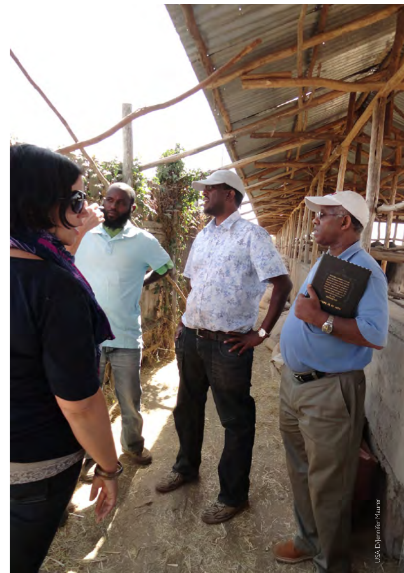
HoA JPC conducts a joint field visit in Ethiopia

The Drought Disaster Resilience and Sustainability Initiative (IDDRSI) presented and endorsed at an IGAD General Assembly in February 2013 builds upon the Member States' Country Program Papers for ending drought emergencies. The IDDRSI Strategy and the Country Program Papers identify six priority intervention areas. These form the basis for the IDDRSI annual action plan for 2013. USAID's resilience building projects and programs, formulated through the JPCs, are designed to complement the seven priority areas: