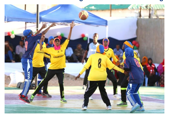
Girls basketball is bouncing back in Somalia and uniting divided communities.

In areas previously controlled by al-Shabaab where sports, arts, and cultural activities were strictly prohibited, TIS+ supports the restoration of Somali dialogue, arts, culture and sports to their original prominence in Somali society. These activities, which promote social cohesion and peace in communities, are particularly important for engaging vulnerable populations who have endured trauma and social and political exclusion. USAID funded the second annual Mogadishu Book Festival in August 2016, the most high-profile cultural event held in Somalia over the last twelve months, and assisted the Somali Olympic Committee and the National Basketball Federation in hosting the first women's national basketball tournament in 26 years. In addition, TIS+ has constructed, rehabilitated and supported sports facilities and dozens of sports initiatives that serve more than 50,000 at-risk youth across Somalia.